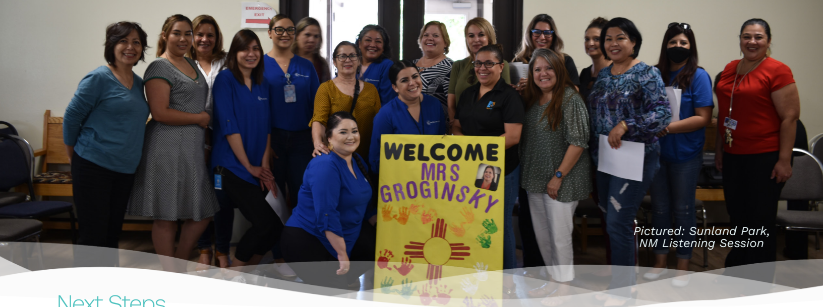
Pictured: Sunland Park, NM Listening Session