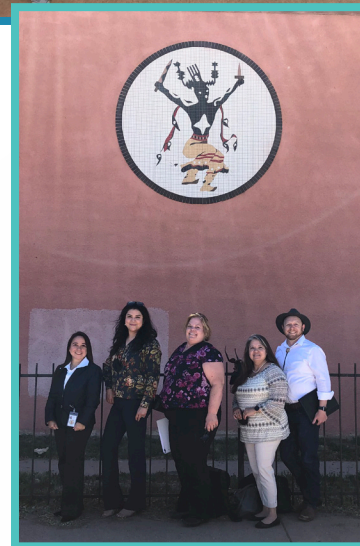
Picture Locations: 1. Zia Pueblo 2. Mescalero Apache G2G Consultation