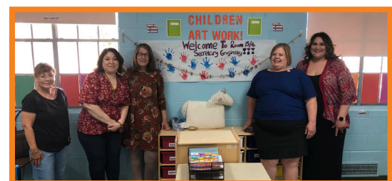
Picture Locations: 1. Mighty Movers in Roswell, NM 2. Clayton Public Schools 3. Zia Therapy in Alamogordo, NM.