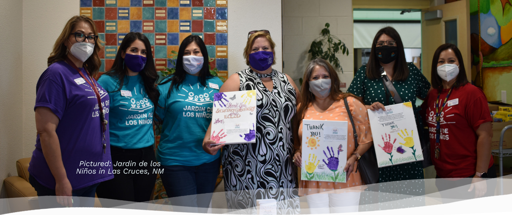
Pictured: Jardín de los Niños in Las Cruces, NM